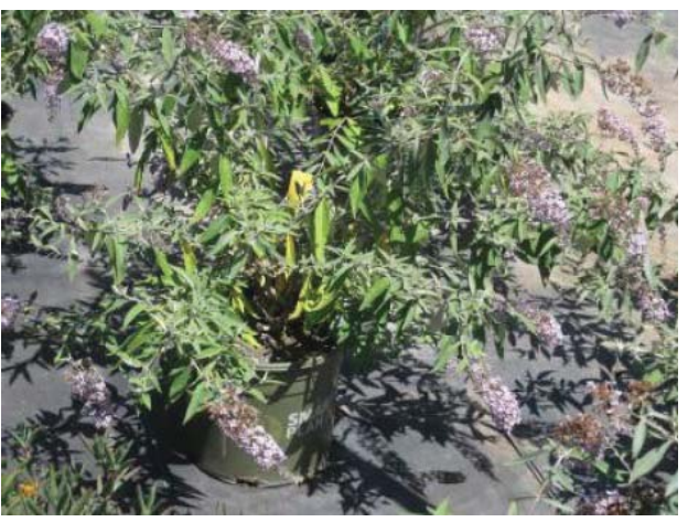
Butterfly Bush Plant