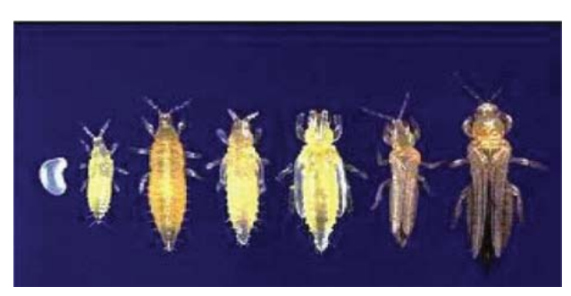
Thrip Egg to Adult Stages of Life

Four weeks after the first treatment (WAT) application, the UTC had less adult thrips than the rest of the treatments. Natural predators were observed when doing alcohol extractions; it is possible that these insects had a significant effect in the number of thrips in the control, but not in the insecticide-treated groups where the chemicals applied could have lowered their numbers. PROUD 3® efficacy is discussed on the next page.