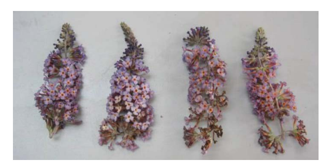
Butterfly Bush Panicles Image by Lucia Villavicencio