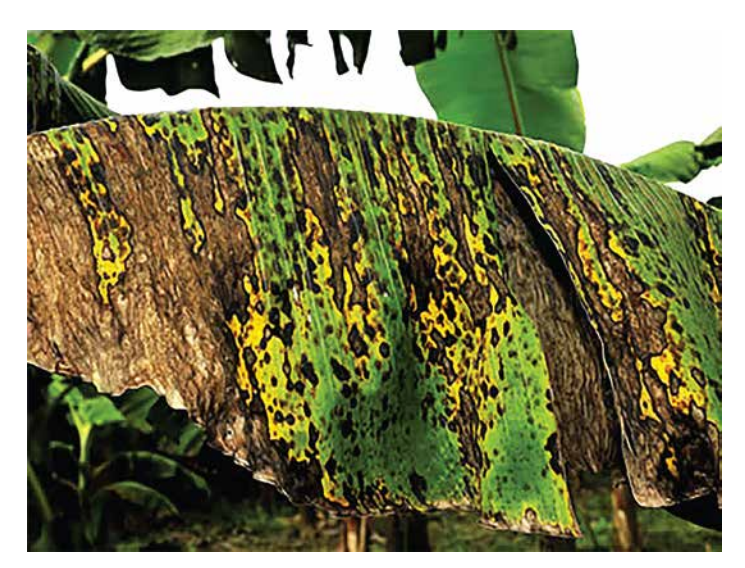
Banana Plant with Advanced Stages of Black Sigatoka Disease http://www.agfax.net/radio/detail.php?i=224&s=t