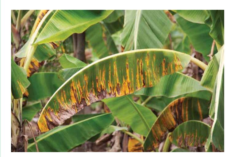
Banana Plant Affected by Black Sigatoka Disease http://bananaroots.wordpress.com/2014/07/19/spotting-panama-disease-on-the-fly/

Five banana plants of the same age were randomly selected for each treatment and concentration in this trial. One leaf per plant was treated by one of the following: 1) Bio Huma Netics' (BHN) PROUD 3® at two concentrations of 3 cc/L or 5 cc/L, 2) BHN PROMAX™ at two concentrations of 5cc/L or 8cc/L, 3) commercial practice, and 4) untreated control (UTC). The fully-open leaf of each sample plant was tagged for treatment application. A volume of 200 mL of fungicide solution was mixed and then immediately poured into an Orchid® hand-atomizer and sprayed within the 4" x 4" hole of a plastic board that was positioned near the tip of the first-fully open leaf of the test plant. The sprayed portion of the leaf was marked using a Pentel® pen. A color-coded ribbon was tied to the sprayed leaf for each treatment. Black Sigatoka measurements were taken from the treated leaf at two-day intervals until termination of the study. The number of days that elapsed between treatment application and occurrence of Black Sigatoka symptoms was determined at various stages of disease development (Stage 0-1: speck stage; Stage 2: first-streak stage, reddish-brown; Stage 3: second-streak stage, reddish-brown turning to brown; Stage 4: first-spot stage, black; Stage 5: second-spot stage, black spot surrounded by yellow; and Stage 6: mature spot-stage, chlorotic stage, gray). (See Figure 1)